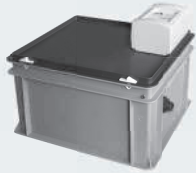
Neutralizer mm 480 x 300 x H 320